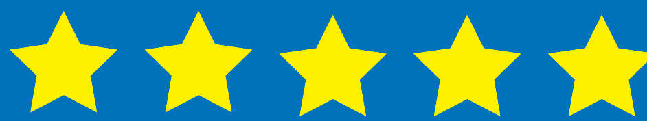
Teodora North Macedonia